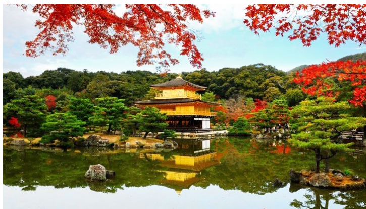
Temple of the Golden Pavilion, Kyoto