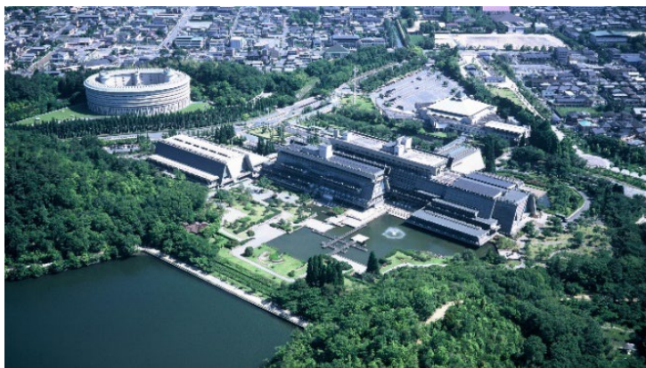
Kyoto International Conference Center (KICC)